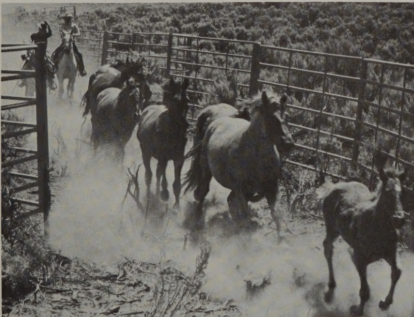
The foal running in front of the band demonstrates the easy pace set by the helicopter pilot and wranglers during capture operations. If herded too rapidly, foals tire and lag behind the rest of the band.

The area is fairly open, with no trees or tall bushes to hide behind and only small hills and mounds of rock outcropping scattered across the generally flat rangeland. The trap, somewhat obscured by the location, is camouflaged by